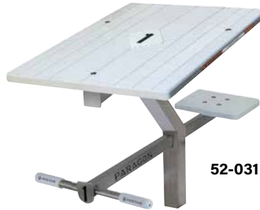
Track Start Quickset Read Mount Platform