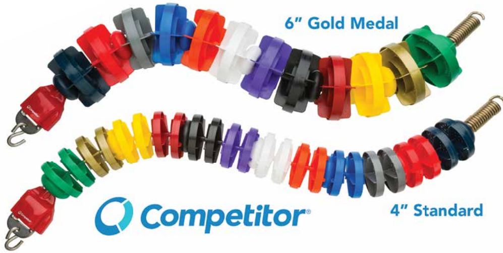
6" Gold Medal