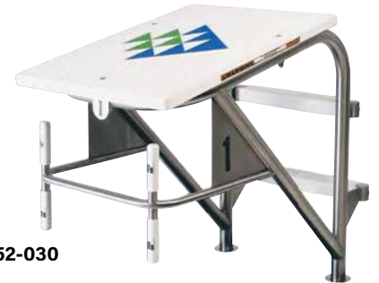
Competitor Track Start-Rear Mount Platform