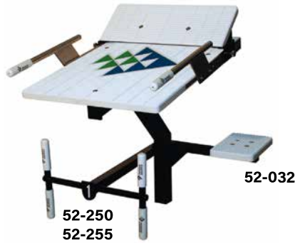
Track Start Quickset Side Mount Platform (shown with options)