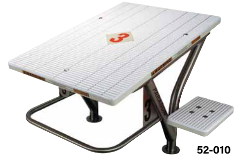
Competitor Track Start - Side Mount Platform